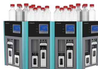
Different batches samples with Multi-method running Channels can be expanded with online running

·Special SPE cartridges are also compatible such as Immune affinity module, which could be applied various types of toxin detection. ·Quickly trail and assemble different loading modules, it can increase to more than 60 water samples continuous processing for environmental testing. ·Different kinds of SPE operating methods can be set for the various complicated sample.